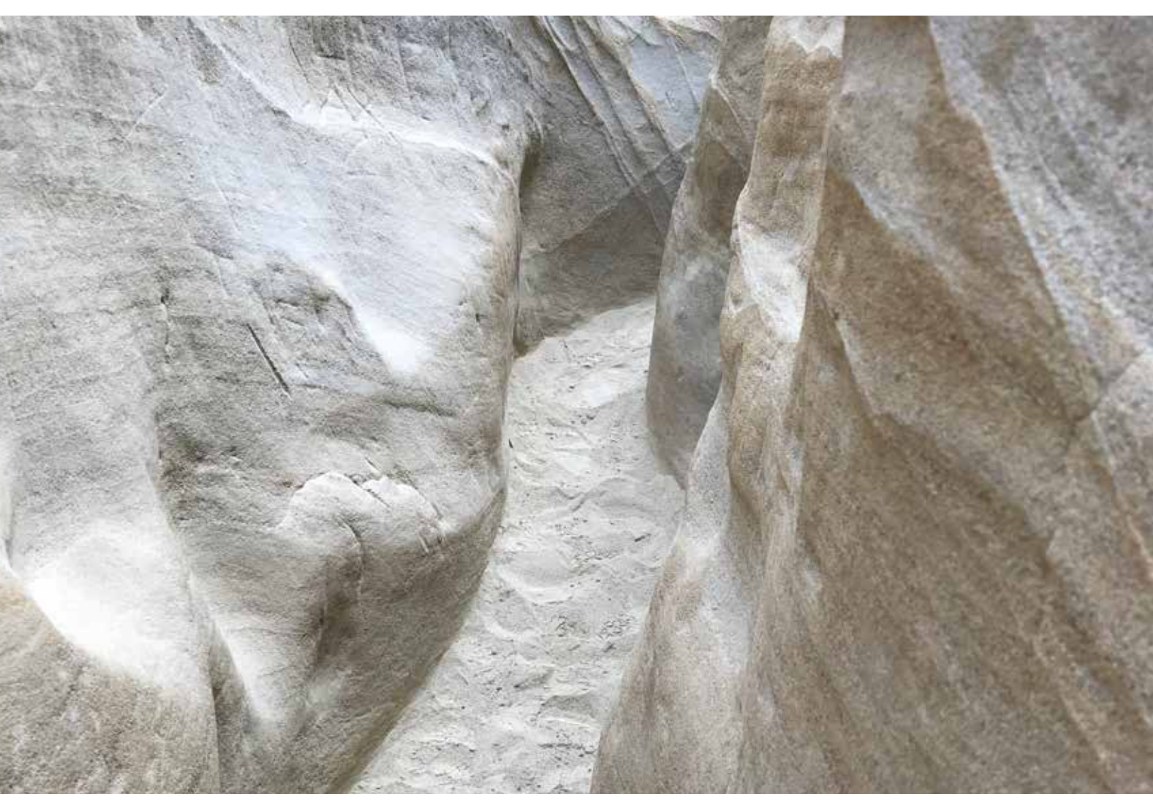
Annie's Canyon Trail, San Elijo Lagoon Ecological Reserve San Diego, CA